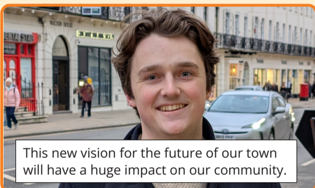
This new vision for the future of our town will have a huge impact on our community.

The Leamington Transformation Board has published its vision for the future of Leamington, with huge implications for our community.