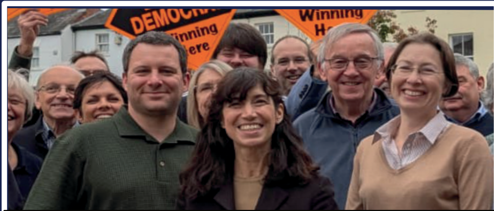
The local plan will determine the future of our community, have your say!

Have your say on the future of our community