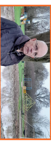
Castle Farm play area - got promise from District Council of new equipment in 2025.