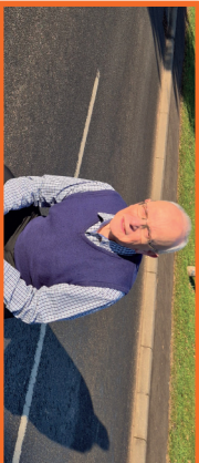
Rouncil Lane - pushed Severn Trent to try to resolve drainage smells.

Not just promises, but a record of working with you and getting things DONE!