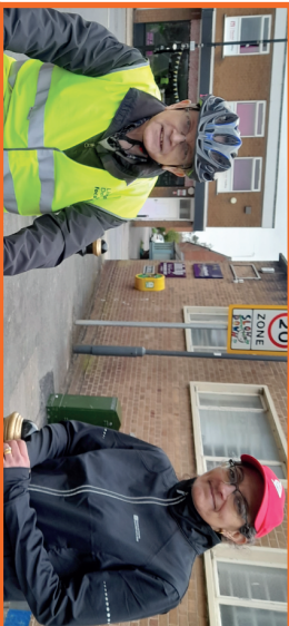
Abbey End - helped organise first ever Clean Air Day to encourage active travel.