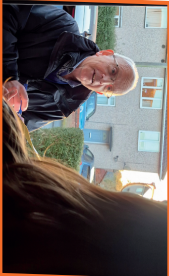
Keeping in touch and working hard all year round.

Not just promises, but a record of working with you and getting things DONE!