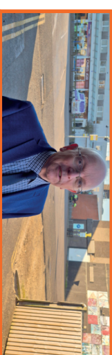
Talisman Square - worked with residents and others to try to stop new apartments development.