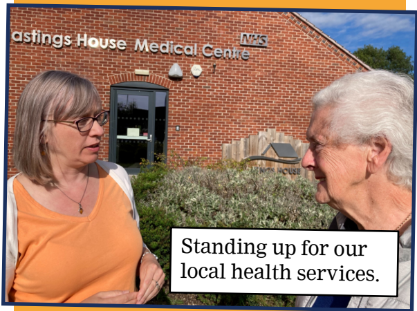
Standing up for our local health services.