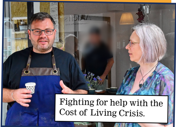
Fighting for help with the Cost of Living Crisis.